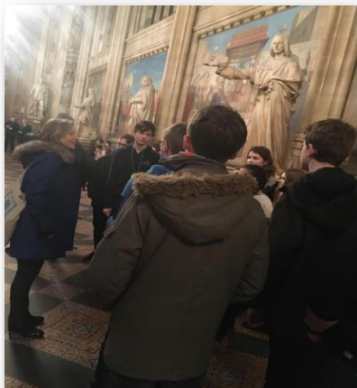
Our Politics Club visited the Palace of Westminster

At Stowmarket High School we wish to provide opportunities for all students to succeed and excel in the classroom. In addition to daily opportunities for a wide variety of sports, there are a large number of clubs and activities on offer to students; many clubs are after school on either a Tuesday or Thursday, when we arrange a late bus.