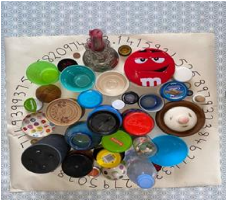
Reece Coppin – a creativity way to represent pi using objects from in the home.