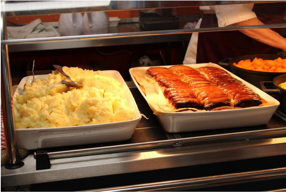
Example of today's Meal Deal, Sausage, Mash and a Traybake