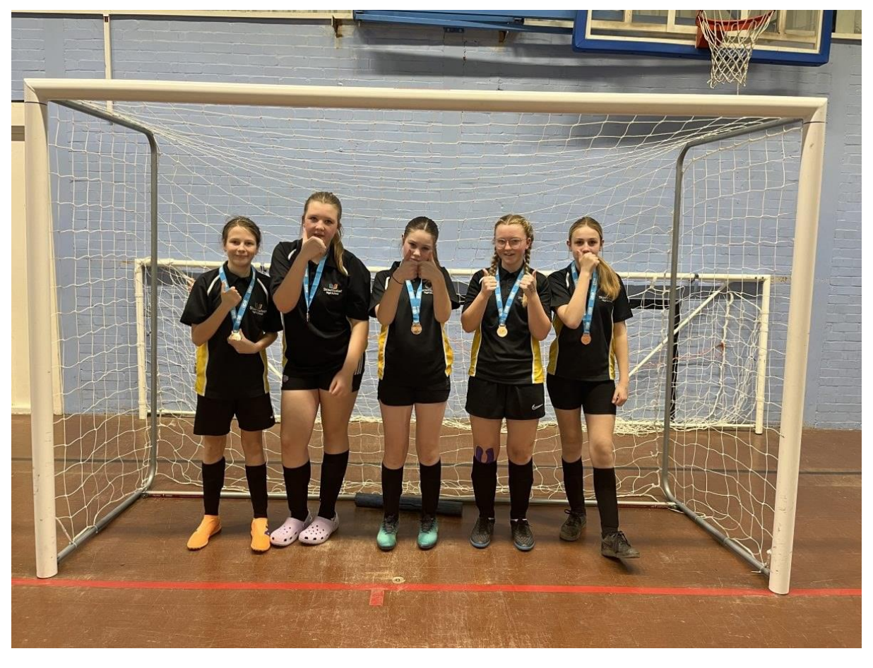
PE Newsletter 20th-24th March