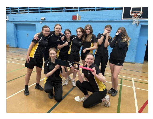
5 - On Tuesday a team of year 9/10 girls competed in the West Suffolk Indoor Cricket Tournament. They faced Culford School and Sybil Andrews.

The girls came 2nd overall, beating Sybil Andrews and loosing narrowly to Culford School. The organiser from Suffolk Cricket gifted the girls a set of stumps, balls and bats as she was so impressed with their attitude and progression of ability over the tournament.