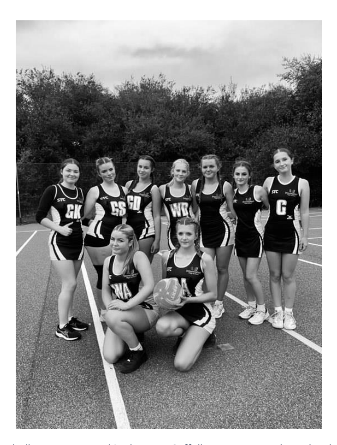
1 - On Thursday the U16 Netball team competed in the West Suffolk Tournament where they knew there was a chance to qualify for the county finals. They faced a variety of schools over the day and played with little or no rest in between games. They faced County Upper, Culford, Sybil Andrews, Thurston, King Edwards and Finborough.

The girls started their tournament extremely well beating County 14-0, Thurston 7-0 and Sybil Andrews 12-4. Much to their delight, they then beat Culford 12-4 in what was a very high intensity game. With the girls beginning to tire, they then played Finborough School who won the competition last year. The girls matched their intensity throughout but fell short at the end loosing by only 2 goals. Their final games was against KEGS which was another evenly matched game. The girls were behind by two in the first half but came back in the last two minutes to win the game by two.